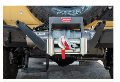
Removable mounted winch and rear folding step