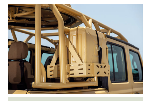
Versatile jerry can holder..