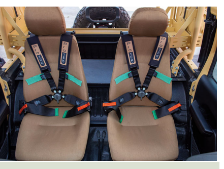
Optional seats with 4-point seat belts