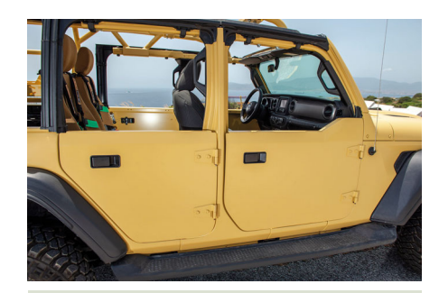
Optional half doors