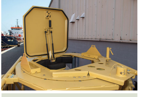
360° turret ring